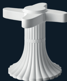
MATT WHITE (.052)

Matt white is a very high-quality powder coating by which the taps and accessories are cleaned and pre-treated in order to then apply the powder to the electrically conductive surface. The powder is then burned into the surface at temperatures of up to 482 °F. The heat causes the structures of the paint powder and the surface to cross-link, resulting in a resistant, durable and very attractive coating that also has protective properties. Use soft soap and water for cleaning - never abrasive substances. It is recommended that the surface of the product be wiped dry after use to avoid stains.