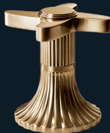
SUNSHINE MATT (.041)

On top of the basic layer of Nickel a 18 carat Gold plating follows. Included in the Gold alloy is "Indium". Indium gives the surface more stability and hardness in comparison to Gold. Clean with soft soap and water and avoid rubbing the surface with anything other than a soft cloth. Lightly apply a spray on wax and avoid buffing. Pat the wax off rather than shine the surface. This is a living finish with no warranty.