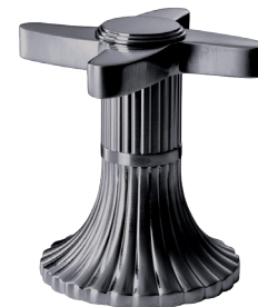
MINK MATT (.096)

Mink is an electroplated surface, which makes the product appear in an elegant anthracite. Just as hard as chrome, it is comparably resistant to chemical cleaning agents and equally resistant to tarnishing. To protect the polished surface against corrosion the first step in the electroplating process is also a layer of nickel. Use Simichrome to clean the finish and Flitz Wax to protect the finish from spotting.