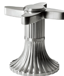
SATIN NICKEL (.036)

Polished nickel has a very pleasant effect due to its warm mirror reflections and is ideal as a finish for the bathroom. The nickel coating, which is about twice as thick, serves not only as an excellent corrosion layer, but also supports a long service life. As nickel tarnishes, it is recommended to wipe and clean it regularly to maintain its shine. It is recommended to pat the surface dry after use to avoid hard water stains. It can be cleaned with liquid soap and water or a 50/50 solution of water and light vinegar. Do not let the vinegar solution soak in, but rinse with sufficient water. Stubborn dirt can be removed with the Simichrome polish. In addition, a wax will protect the surface against staining.