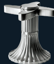
PLATINUM MATT (.066)

The colour of Platinum is very similar to Polished Nickel. Nickel is applied first, but because Nickel is not a permanent finish, we cover the surface with Platinum. Platinum is very exclusive and very resistant to corrosion and shows high abrasion resistance. Clean with Simichrome and wax the surface with Flitz Wax to avoid spotting.