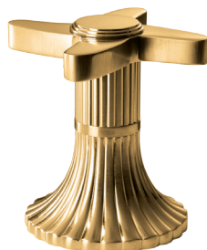
GOLD MATT (.021)

Gold matt is a galvanised surface, the finish resulting from 23-carat gold plating applied to a nickel base layer. The alloy components harden the surface with a yellow tint that is stronger than the one found in fine gold. The surface is then hand-brushed before electroplating with gold for a “living” finish, giving it its precious matte shade. It is best to clean this surface with neutral liquid soap and water. Use only a soft cloth and pat the surface dry rather than rubbing it.