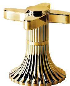
ANTIQUE GOLD (.025)

Gold matt is a galvanised surface, the finish resulting from 23-carat gold plating applied to a nickel base layer. The alloy components harden the surface with a yellow tint that is stronger than the one found in fine gold. The surface is then hand-brushed before electroplating with gold for a “living” finish, giving it its precious matte shade. It is best to clean this surface with neutral liquid soap and water. Use only a soft cloth and pat the surface dry rather than rubbing it.