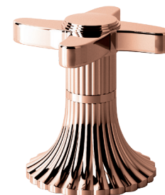
ROSE GOLD (.022)

After Gold plating, an additional process is applied with silver ingredients that let the product turn completely bluish. It is then polished by hand. After polishing, the blue colour only remains in the deeper recesses of the product. Clean the finish as GOLD (.020). This is a living finish with no warranty and only available for the collection APHRODITE and CRONOS.