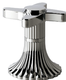
POLISHED NICKEL (.035)

It also receives an additional clear lacquer layer, which protects the sensitive surface from small scratches, external damage and abrasion and, above all, prevents discoloration through oxidation. Use soft soap and water for cleaning - never abrasive substances. It is recommended that the surface of the product be wiped dry after use to avoid stains.