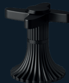
MATT BLACK (.092)

Matt white is a very high-quality powder coating by which the taps and accessories are cleaned and pre-treated in order to then apply the powder to the electrically conductive surface. The powder is then burned into the surface at temperatures of up to 482 °F. The heat causes the structures of the paint powder and the surface to cross-link, resulting in a resistant, durable and very attractive coating that also has protective properties. Use soft soap and water for cleaning - never abrasive substances. It is recommended that the surface of the product be wiped dry after use to avoid stains.